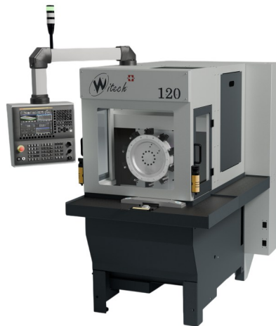
Vertical 3 axes lathe