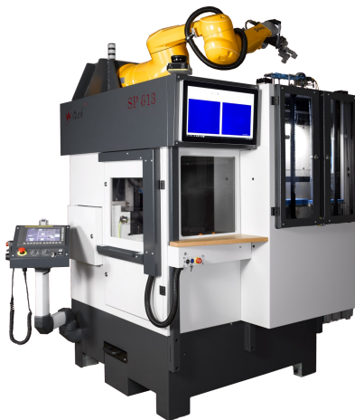
Robotic multi-axis machining center