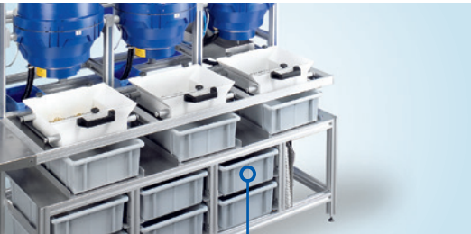
Manual separating unit using manual screen