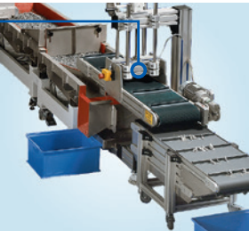
System for storing additional plastic containers for media

Let us prove to you how advanced our technology is We will be pleased to prove the claims we make with regard to our company and the efficiency of the CF series of disc finishing machines. On request, we will provide you with specific and detailed advice on the right finishing system for your application, including formulating the right grinding and polishing media for you. And what's more, we will also finish a sample of your product free of charge and without any obligation whatsoever - and provide a report of all relevant process parameters.