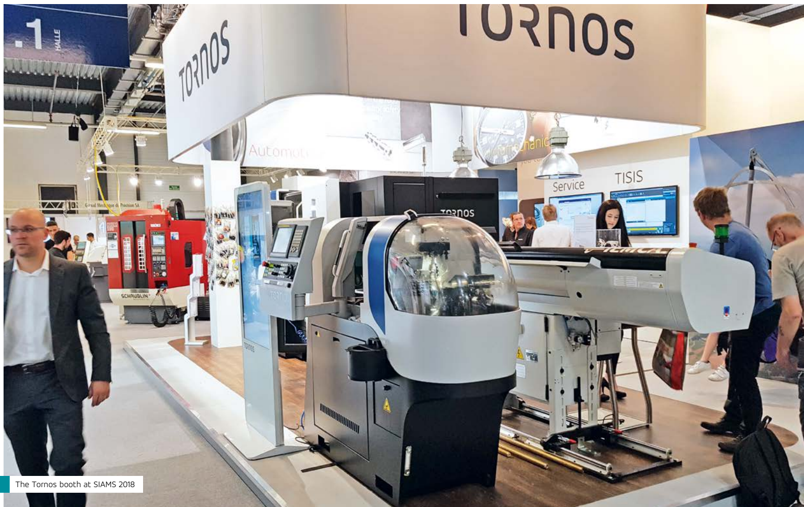
The Tornos booth at SIAMS 2018