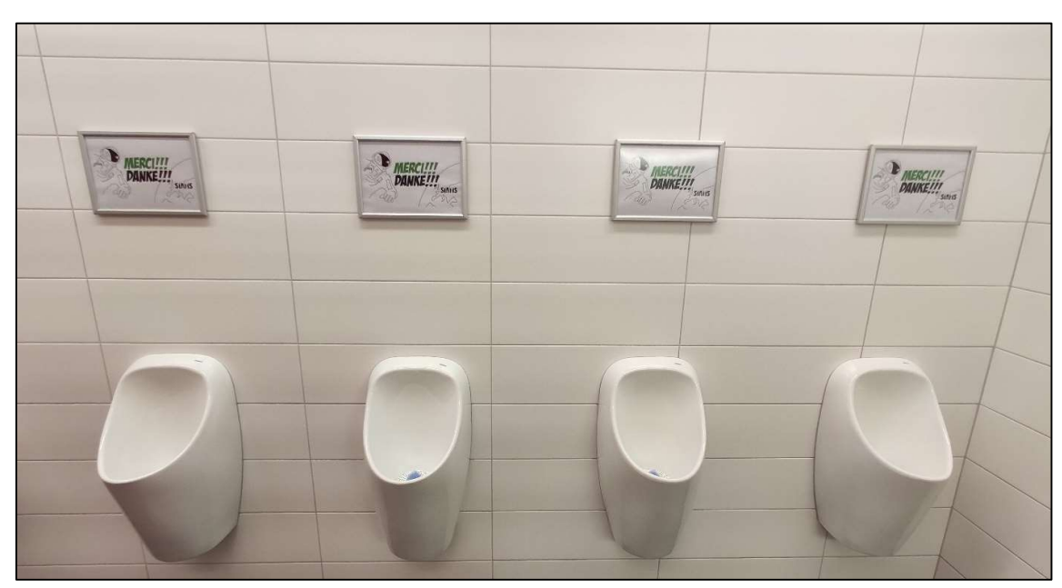
Undeniable visibility in one of the Show's most visited locations.

If you have any questions or would like to place an order, please contact Christophe :