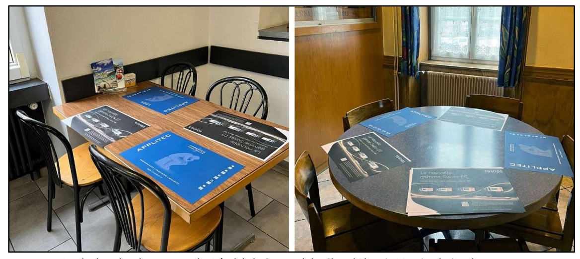
Just look at the placemats at the Hôtel de la Gare and the Cheval Blanc in Moutier during the set-up.

Should you be interested, we shall send you the technical file specifications. If needed, our realization partner will be available to create the file according to your request for 95.-/hour.