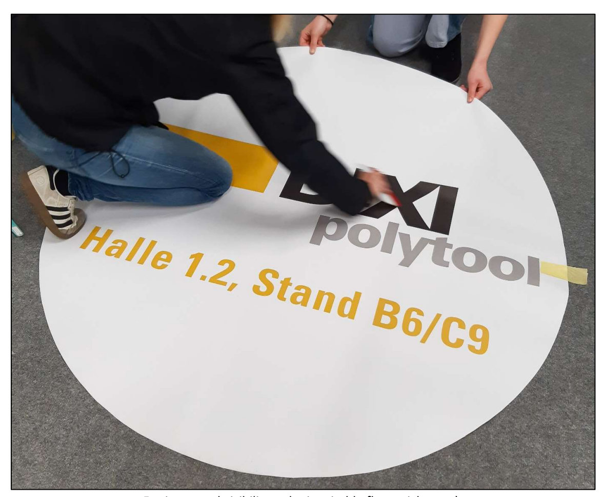
For increased visibility... the inevitable floor stickers ;o)

Should you be interested, we shall send you the technical file specifications. If needed, our realization partner will be available to create the file according to your request for 95.00/hour.