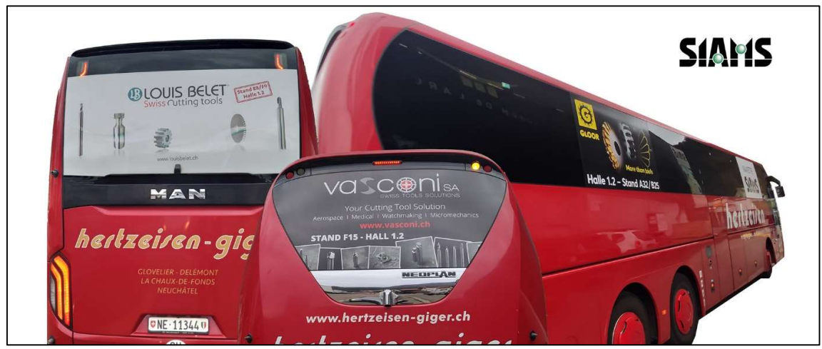
Some views of the 2022 buses. They looked truly "cool".

Should you be interested, we shall send you the technical file specifications. If needed, our realization partner will be available to create the file according to your request for 95.-/hour.