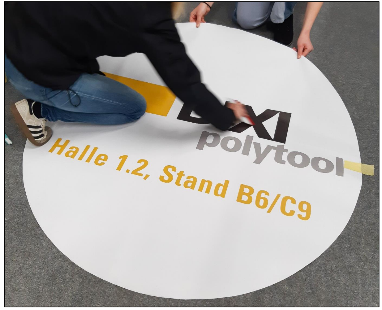
For increased visibility... the inevitable floor stickers ;o)

Should you be interested, we shall send you the technical file specifications. If needed, our realization partner will be available to create the file according to your request for 95.00/hour.