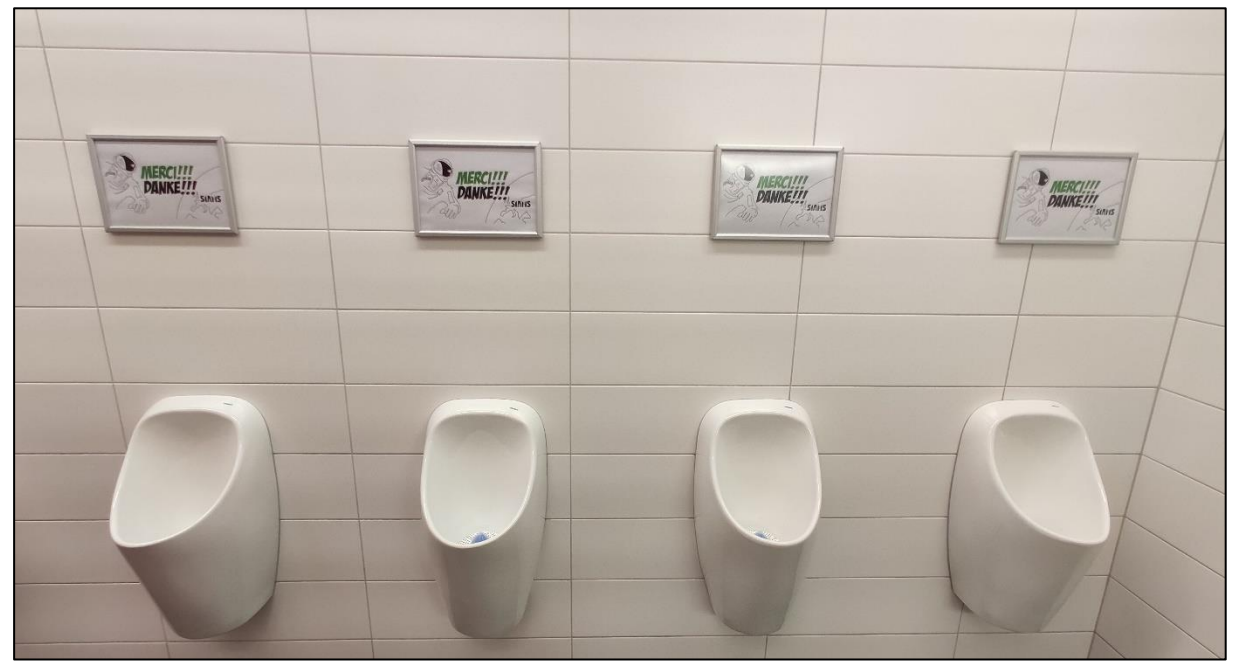
Undeniable visibility in one of the Show's most visited locations.

If you have any questions or would like to place an order, please contact Christophe :