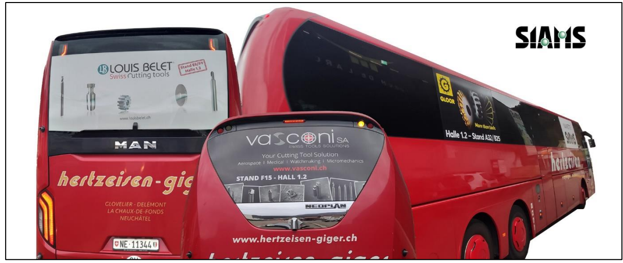
Some views of the 2022 buses. They looked truly "cool".

Should you be interested, we shall send you the technical file specifications. If needed, our realization partner will be available to create the file according to your request for 95.-/hour.